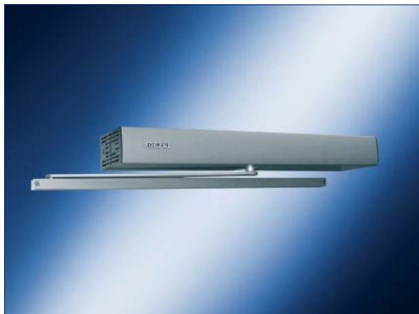
GEZE Slimdrive EMD

*) Notice the admittance of the respective smoke and fire protection door.